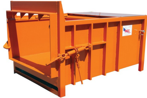
Mighty Mac 250 Series

These heavy duty body assemblies are 50% stronger than others on the market. Solid 3/8" plate side walls are further reinforced with structural tube top rails, 1" x 3" solid horizontal bar and 3" structural channel verticals. The 8" x 6" x 3/4" breaker bar is supported by 4" x 3" x 1/4" structural steel tubing and gusseted with 1/2" thick plate. This extra rugged construction totally eliminates side wall deformation even under extreme conditions.