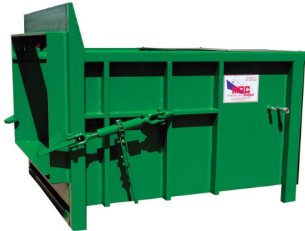
Mighty Mac 220 Series

The Mighty Mac 2 YD series 220 and 2.5 YD series 250 compactors provide high compaction forces in a shorter, space saving footprint. Up to 40% shorter than standard compactors, the 220 and 250 have more than 54,000 and 62,000 lbs. of maximum packing force respectively.