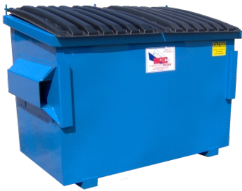
Two, three, and four cubic yard style

Available in two through ten cubic yard capacities, MAC front load containers are constructed of quality AISI grade steel and designed for years of rugged dependable service. Each container meets or exceeds all industry standards and carries a full one year warranty.