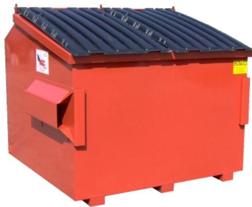
Six and eight cubic yard slant style