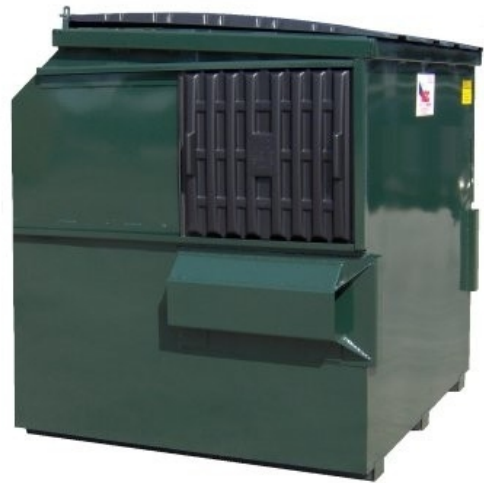
Six, eight, and ten cubic yard Hi-Side